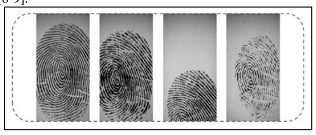
Figure 3: Typical View of finger surface pattern

We investigate some representative FQA literature to illustrate the solutions proposed thus far. The biometric quality of a fingerprint sample is not always the same as it is estimated by subjective criteria. The biometric definition should be linked to the expected matching performance of the qualified fingerprint samples. This issue can be easily illustrated by some examples, as shown in Figure 2. [8-9]